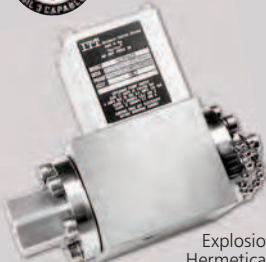
Explosion Proof Hermetically Sealed (NEMA 4X, 7, 9 and 13)