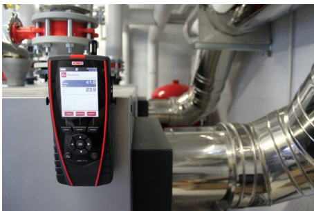
Climatic conditions measurement

AMI 310 PRF : portable instrument supplied with a ±500 Pa pressure module, a Ø6 mm T Pitot tube, 2 x 1 m of silicone tube, a stainless steel tip, a wireless stainless steel hygrometry probe, a telescopic hotwire probe and a Ø100 mm vane probe