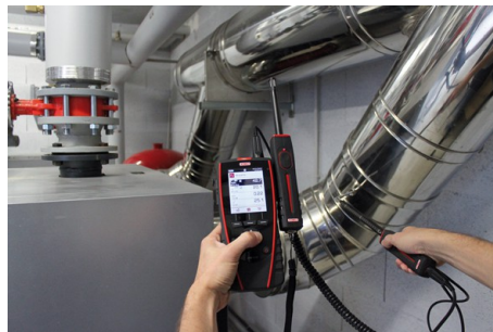
Hygrometry and air velocity measurement